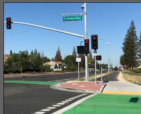
Washington Blvd Bikeway Project

The Town of Loomis completed pavement repair along Boyington Rd and Laird Rd within the Town's limits as part of their Arterial and Collector Pavement Repair