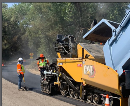
Loomis Arterial and Collector Pavement Repair

The City of Auburn completed pavement rehab/repairs, ADA improvements, and striping repairs on six roadway segments throughout the city, including three on Auburn Folsom Rd