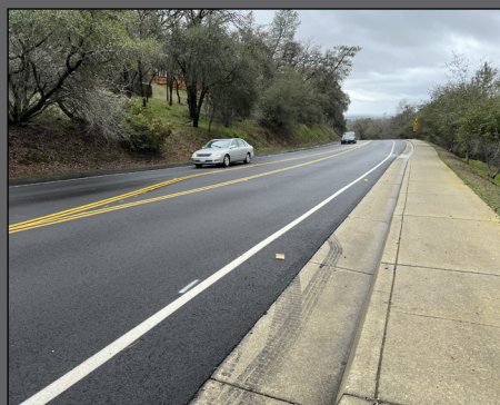
Auburn 2022 Street Overlay Project

The City of Auburn completed pavement rehab/repairs, ADA improvements, and striping repairs on six roadway segments throughout the city, including three on Auburn Folsom Rd